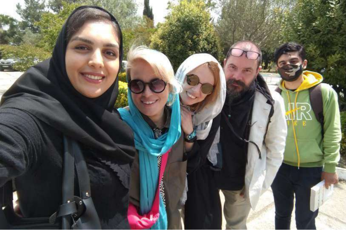
University of Mazandaran, Babolsar, Iran, 2022